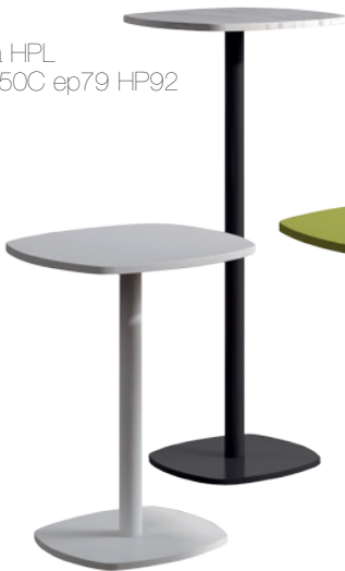
T Circa HPL ht110 50C ep79 HP92