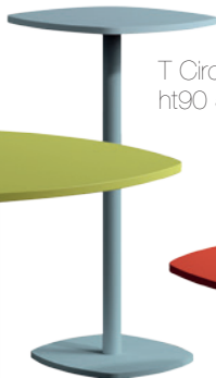
T Circa HPL ht90 50C ep59 HP59