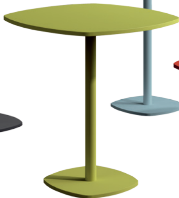
T Circa HPL ht75 70C ep69 HP69